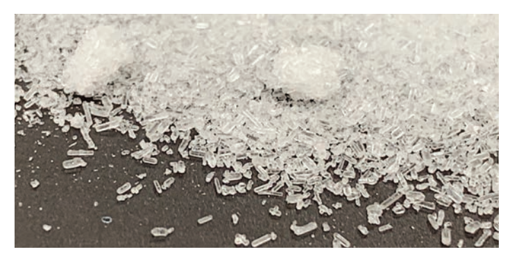
Conventional TRIS crystal structure

The unique morphology of TRIS AMINO AC buffers helps reduce cake strength, resulting in less clumping and hardness than competitive materials.