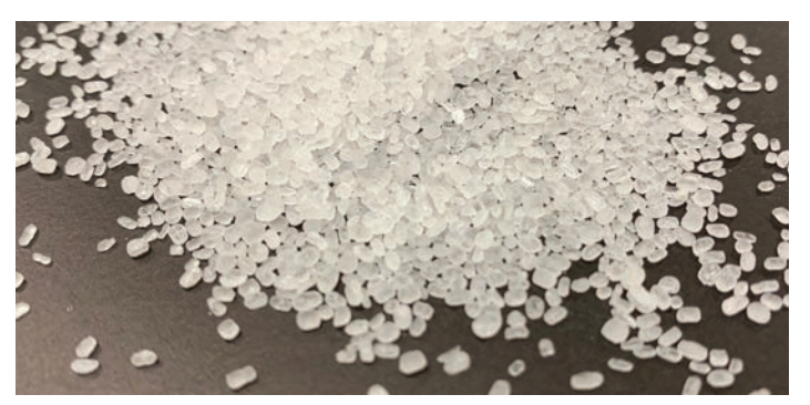
TRIS AMINO AC Advanced Crystals from Advancion