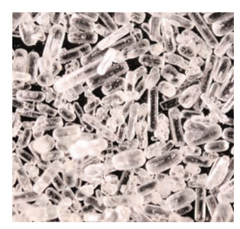
Conventional TRIS crystal structure